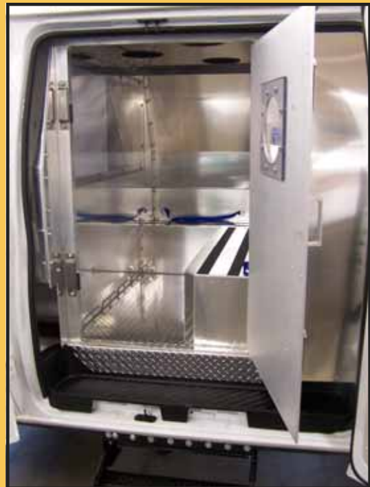
Side security door on T-compartment models.