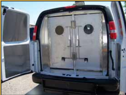
Rear security doors with lock 6"x 9" load lights.