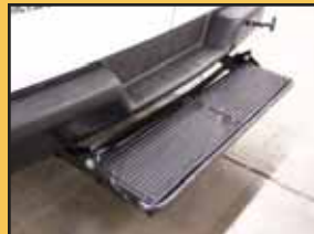
Side and rear steps included.